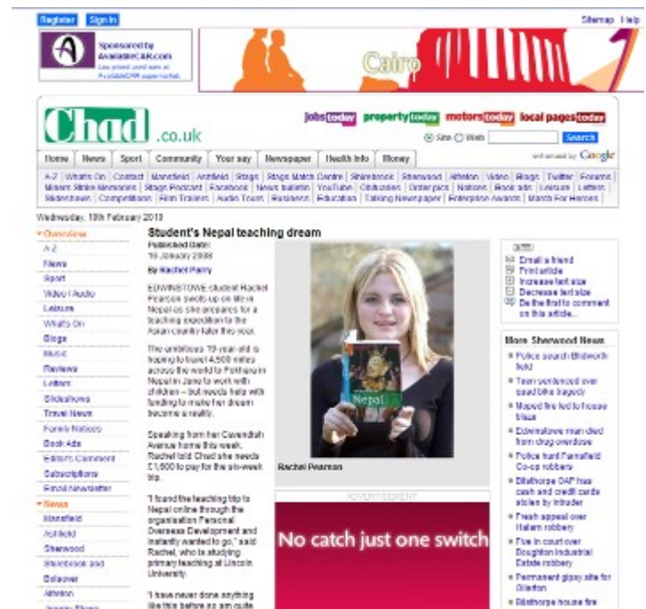
Example of online coverage

For more information please see www.podvolunteer.org ,