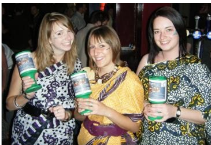
The Pod office team on a night out raising money for Tanzania's ambulance appeal dressed in traditional Kangas!